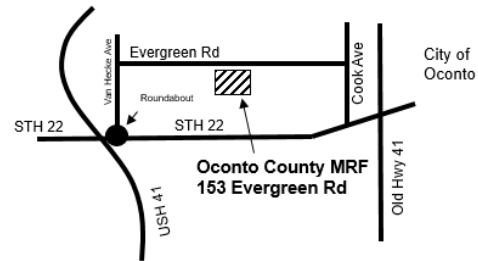
Saturday May 11th, 2024 ~ 8 - 11 am

VSQG's- The Marinette and Oconto County's Clean Sweep Program will accept hazardous waste from small businesses, churches, schools, emergency services, and county facilities that fill out a VSQG (Very Small Quantity Generator) preregistration form. VSQG participants will be responsible for paying all disposal costs. Agricultural pesticides brought in by an agricultural business (Pesticide Applicators, Farm suppliers) & classified as a VSQG, may be eligible for 50% grant funding for disposal of agricultural chemicals. Upon preregistration, a no obligation disposal price quote will be provided prior to bringing material to the collection facility. Please contact one of the departments listed on the front of this flyer for more information. Preregistration is critical to assess safety of transporting hazardous materials to the event and any cost involved for proper disposal.